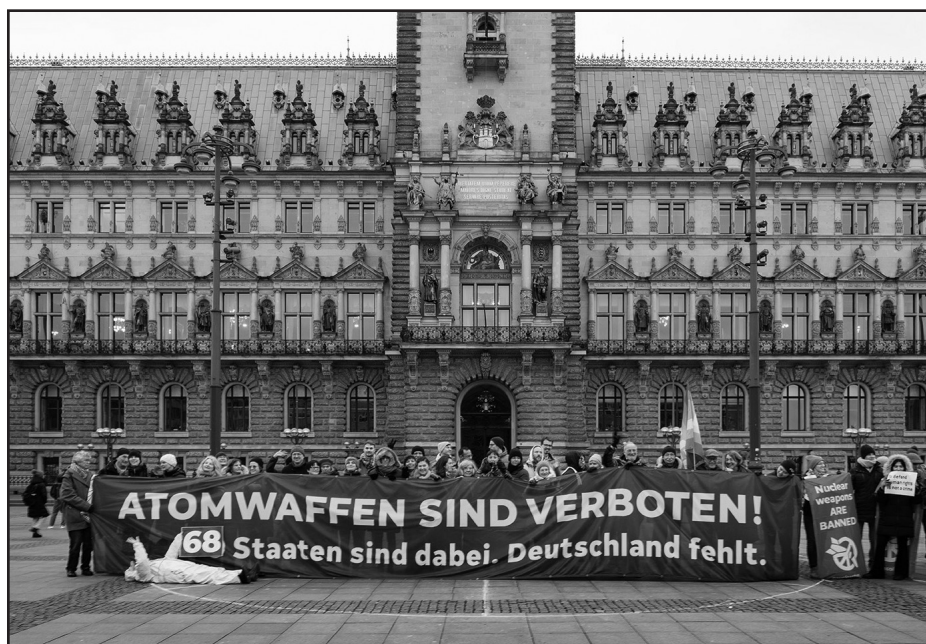
Activists, in front of the Hamburg City Hall, proclaim that 68 countries prohibit nuclear weapons but not Germany. Neither does the U.S. which maintains a training school for military to sustain and deploy its tactical nuclear weapons at Büchel Air Force Base in Ramstein.