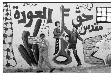
A wall in the Jenin Refugee Camp.