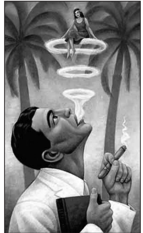
Vintage advertising image featuring a cigar for which Cuba was renowned.

Cuban people have excellent preventive healthcare and medical care provided without fees. According to the World Health Organization, Cuba has the highest doctor-to-population ratio in the world and has sent thousands of doctors to more than 40 countries in need. In Havana, we met a primary care physician who described the care delivered at her clinic for about 890 people in that neighborhood. The doctor often visits people at home, so she becomes aware of their living conditions. She and the clinic nurse