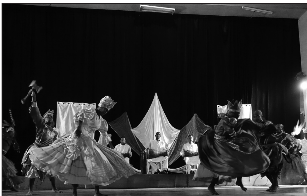
Dance performance at Alba Community Theater by Okan-Tomi, a cultural company that explores and reworks Afro-Cuban dances and music.

Car caravans are usually scheduled for the last Sunday of the month. Check the Solidarity Committee of the Americas (SCOTA) Facebook page or the WAMM calendar to confirm. Sponsored by WAMM's Solidarity Committee on the Americas (#SCOTA_MN) and the Minnesota Cuba Committee.