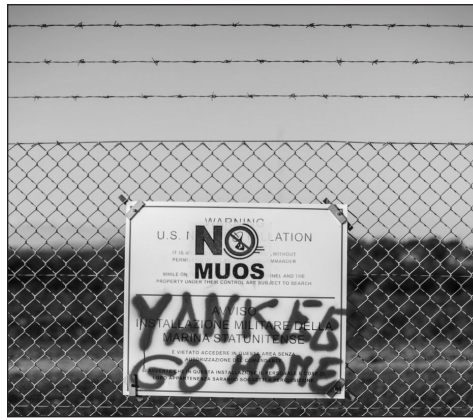
Sign on a local resident's fence in Niscemi, Sicily. Alarmed about effects of high-frequency electromagnetic waves on human health and ecosystems, as well as complicity in warfighting, thousands attempted to block the installation of a U.S./NATO Naval Radio Transmitter system.

It is not much of a leap from this deplorable situation to realize that the staggering growth in military