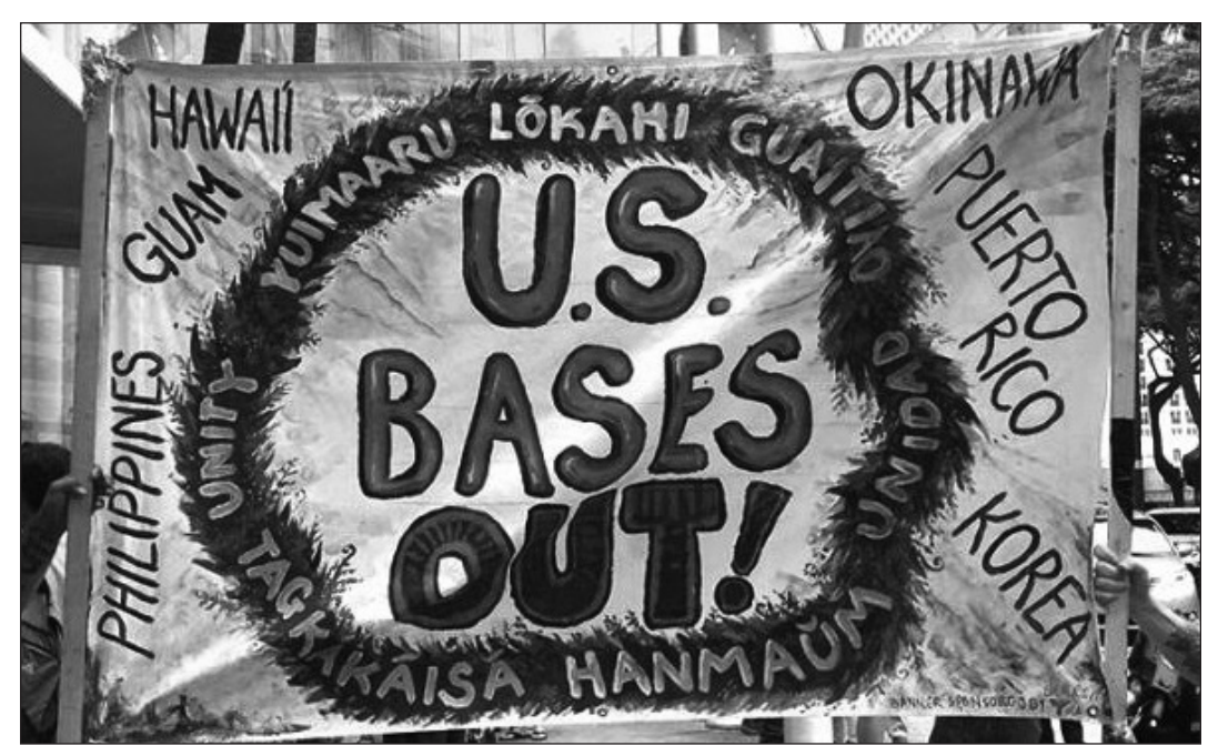
What's the North Atlantic Treaty Organization doing in the Pacific Ocean?

leaders, the bases not only aren't closed but continue to expand and be updated.