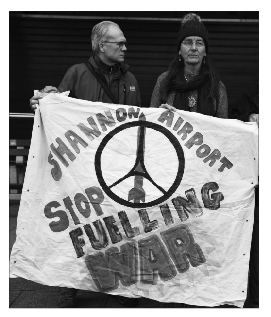
Shannon Airport has been used as a transit point for U.S. soldiers, weapons and extraordinary renditions.

At the GPO, a traditional place of protest in Ireland, the contemporary resisters held a demonstration and bannering, asserting the need for getting rid of U.S./NATO military bases. The leaders of the 1916 Rising had taken over the GPO, making it the working headquarters of their rebellion: It