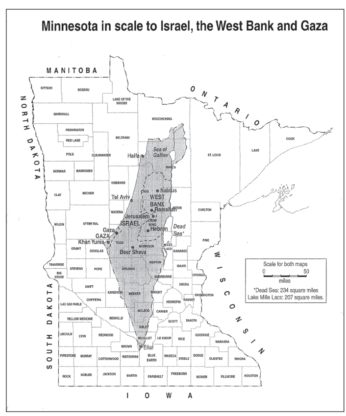
By banning the right to boycott, state law elevates Israel over the constitutional right of free speech for its own Minnesota citizens.

With the ban on boycotting, state legislators have elevated Israel over their own U.S. constituents' constitutional right of free speech.