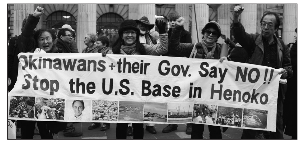
Okinawans protest during the Dublin conference. Resistance is fierce as U.S. bases consume 70 percent of their island and continue to expand.

Who knew that Italy had 10 percent of these bases – some secret, but many active in war? The extent, size, and importance of the U.S./NATO bases in Italy surprised many. U.S./ NATO wars, including the wars against Yugoslavia, Libya, Afghanistan, and countries in the Middle East, have been waged from Italian bases. Two bases hold over 60 nuclear weapons in defiance of Italian law. One base holds the biggest arsenal outside the U.S. Another commands U.S. naval forces for Africa.